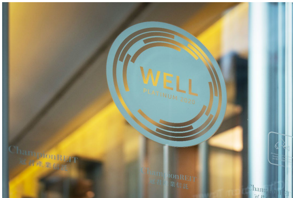
Three Garden Road was the first existing building in Hong Kong to attain WELL Core Existing Building PLATINUM